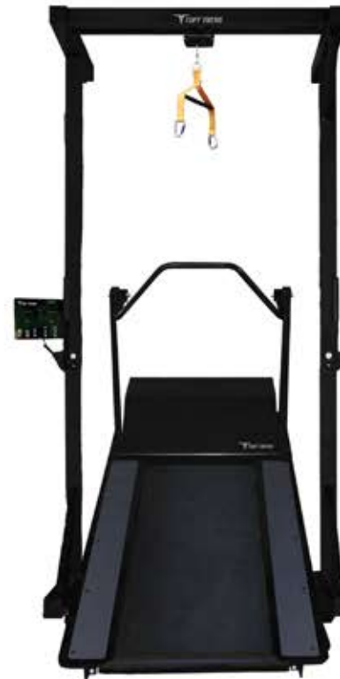
H. P. ELITE MODEL