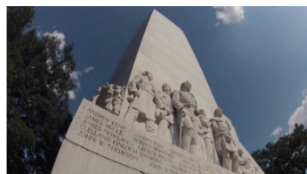
Alamo Cenotaph Fourtrac Creative