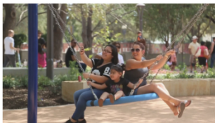
PLAY at Hemisfair: Behind the Design Fourtrac Creative