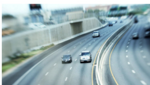
Time Fourtrac Creative