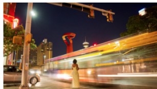
Torch of Friendship Fourtrac Creative