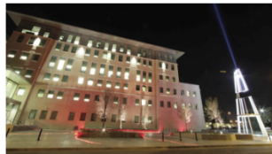
Unity Plaza Fourtrac Creative