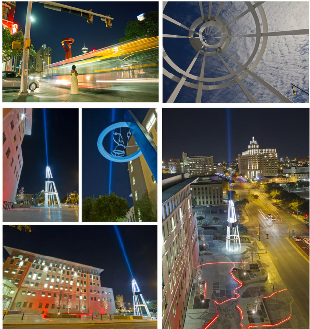
Unity Plaza / Torch of Freedom

The public artwork at Unity Plaza honors the service men and women who “protect the grid” of the City of San Antonio. The plaza contains an 18,000 square foot mosaic map of San Antonio that delineates the San Antonio River, and major roadways and interstates. Lit at night by built in lighting strips, the illuminated roads unite at the plaza's beacon tower which extends almost 60 ft. high, and emits a beam of light extending two miles into the sky. Capping the northern edge of the plaza are two 16 ft steel silhouette sculptures of an officer and firefighter.