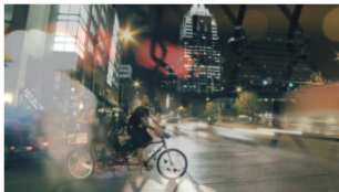
Fourtrac Creative -Trailer Fourtrac Creative

2.2 billion Google users are searching the web right now! Your business needs better quality images, engaging digital media content, and intelligent marketing solutions. Let us help grow your business and your social media sites.